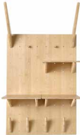
KÅSEBERGA Pegboard $99 99

Today, there are 370 million people across the world interested in surfing and more than 40 million active surfers. And since the sport, quite naturally, takes place in open waters, surfers are generally passionate about tackling environmental challenges such as reducing plastic pollution in the oceans.