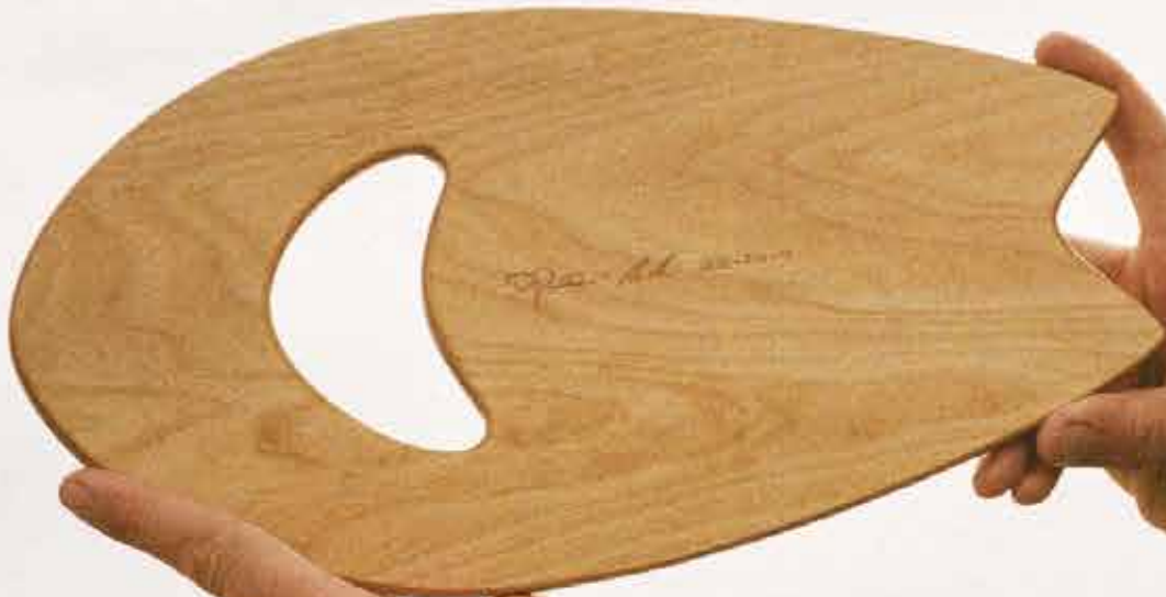
KÅSEBERGA Handboard for bodysurfing $18 99