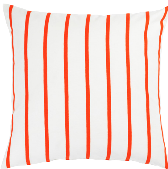
PE896346.jpg NICKFIBBLA Cushion cover $7.99 Cotton/polyester. Imported. Designer: Inez Svensson. 20×20". White orange/stripe 205.609.91