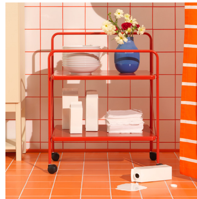
Above: HOFF in the IKEA Catalog 1984 Below: JÄRLÅSA side table on casters 2023