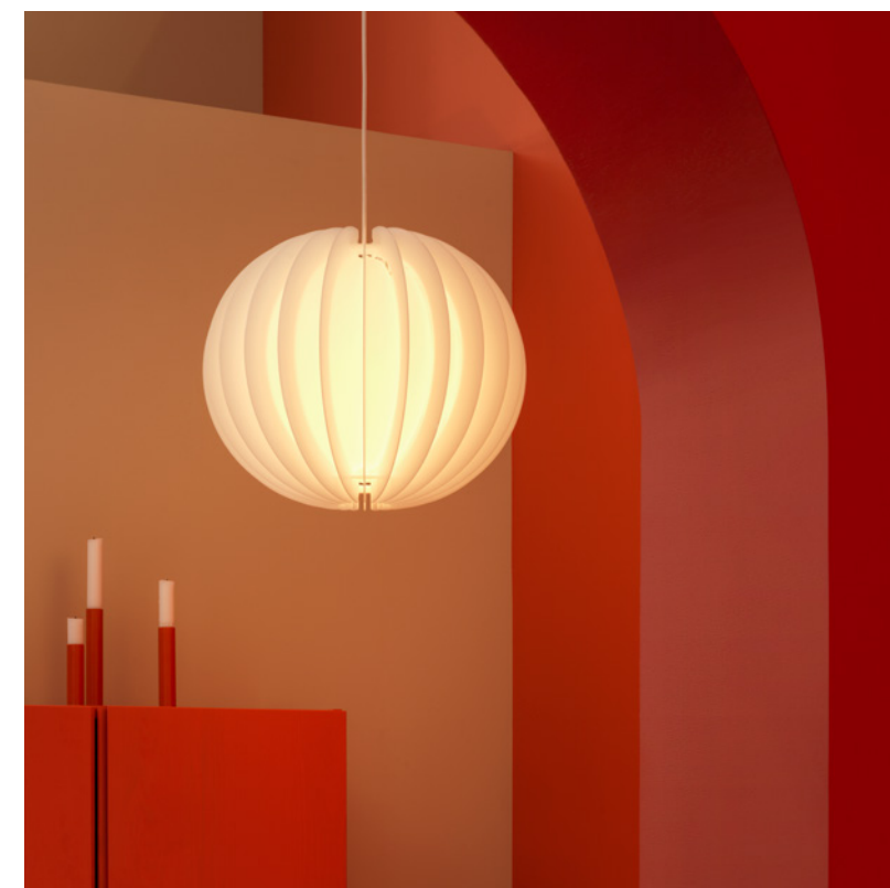
Above: CIRKEL in IKEA Catalog 1979 Below: HAVSFJÄDER pendant lampshade 2023