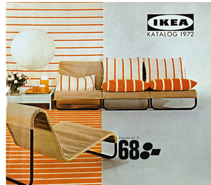
Above: STRIX/STRAX on the IKEA Catalog cover 1972

When Inez passed away in 2005, a great creative star and a true pioneer was lost. For the Nyttillverkad collection, we are now bringing back her well-known pattern STRIX/STRAX as NICKFIBBLA.