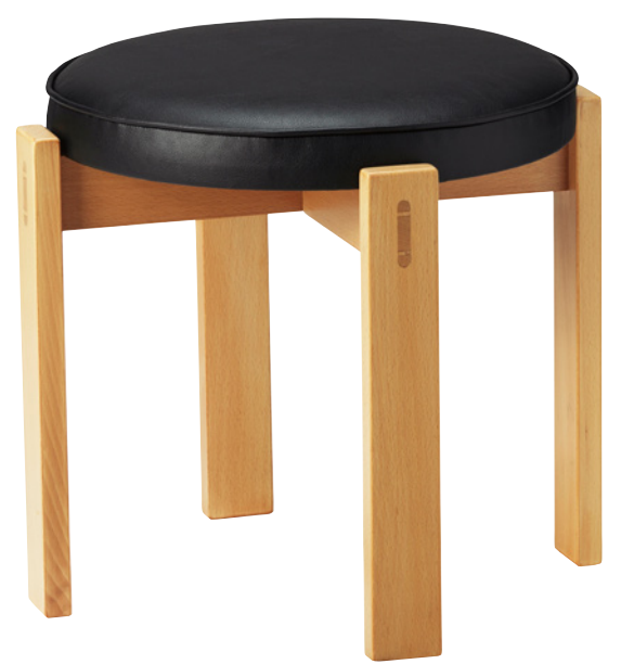
PE895924.jpg HOLMSJÖ Stool $49.99 Polyurethane coated polyester/ cotton fabric. Clear lacquered solid beech. Imported. Requires assembly. W18½×D18⅞×H16½". Beech/Jonsbyn black 105.609.96