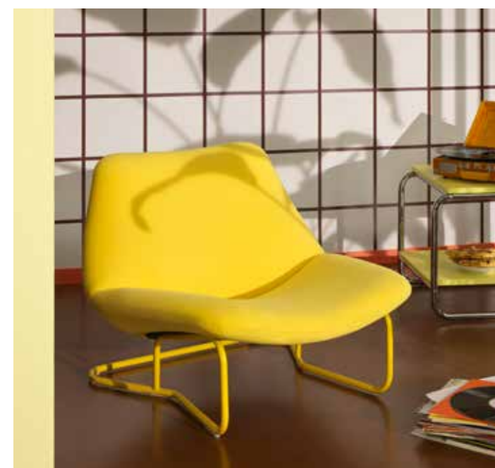
Above: PUCK in the IKEA catalog 1969 Below: SOTENÄS armchair 2024