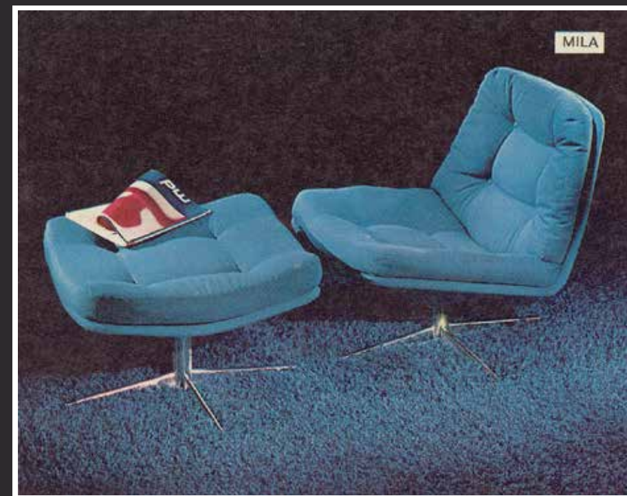
Above: MILA in the IKEA catalog 1967 Right: DYVLINGE armchair 2024

“The anti-stress armchair. This statement may sound rude to the upholsterers who are working hard to meet the fantastic demand for the MILA armchair. But for the rest of us, it feels like a fitting description.”