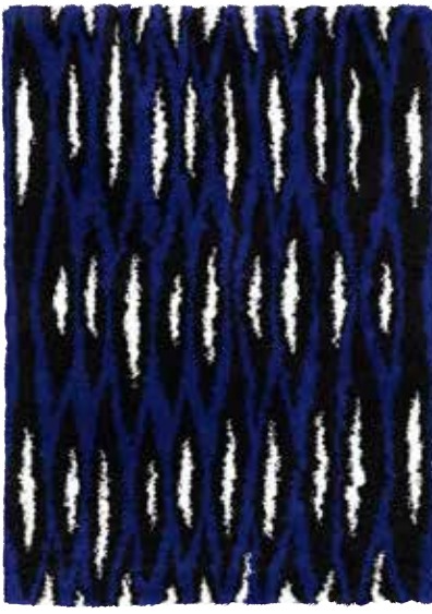
PE907297.jpg New BULLERREMSA Rug, high pile $79.99 100% polypropylene pile. Synthetic rubber backing. Imported. W4'4"×L6'5". Blue white/black 305.552.77