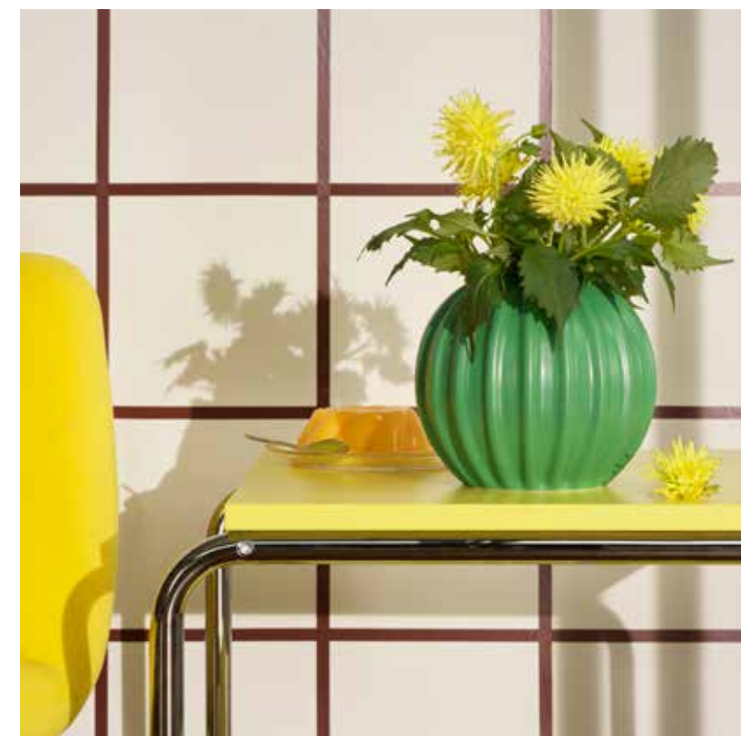
Above: OPTIMUM in the IKEA catalog 1995 Below: SKOGSTUNDRA vase 2024