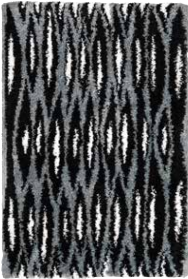
PE907294.jpg New BULLERREMSA Rug, high pile $79.99 100% polypropylene pile. Synthetic rubber backing. Imported. W4'4"×L6'5". Black gray/white 705.543.89