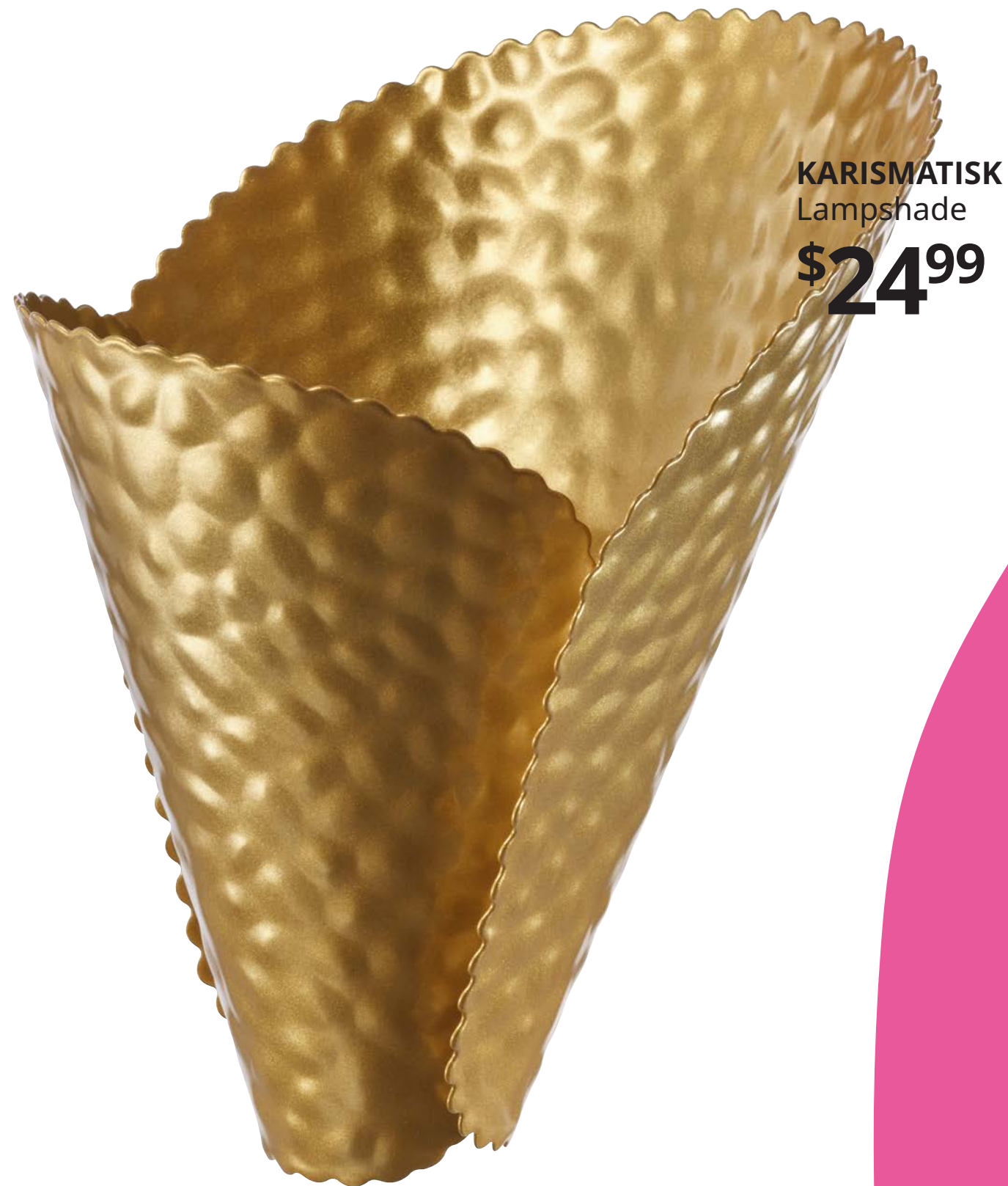
KARISMATISK Lampshade $24 99