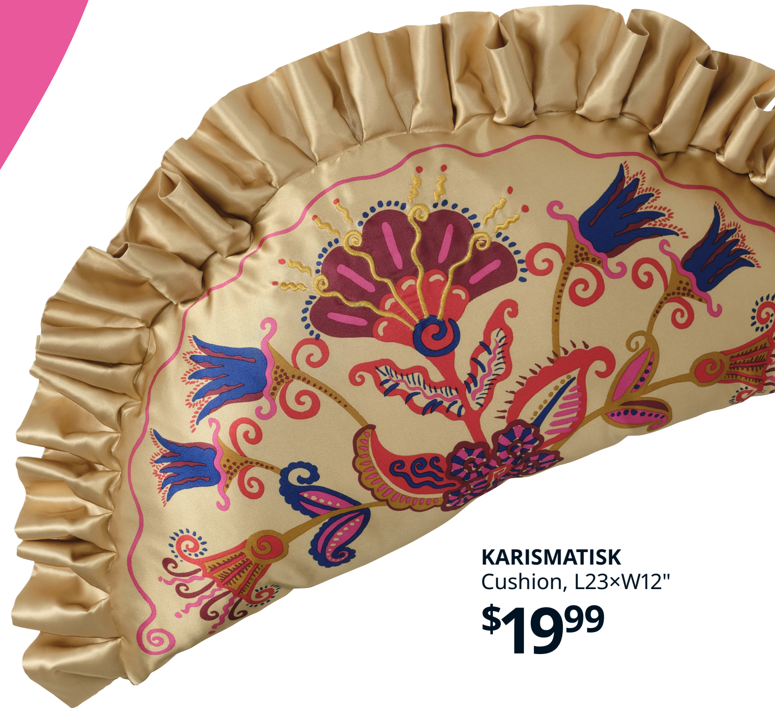
KARISMATISK Cushion, L23×W12" $19 99