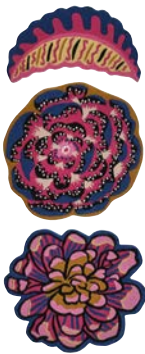
PE826656 KARISMATISK Rugs $89/set of 3 Includes: one rug (W28¾×L12") and two rugs (Ø30¾"). 100% wool pile. Imported. Designer: Zandra Rhodes. Multicolor 904.991.32