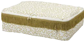
PE826659 KARISMATISK Storage case $19.99 100% polyester. Imported. Designer: Zandra Rhodes. W27×D20×H7". Gold-color 804.990.81