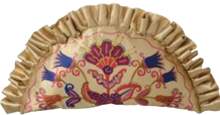
PE826634 KARISMATISK Cushion $19.99 100% polyester cover. Polyester fiber filling. Imported. Designer: Zandra Rhodes. L23×W12". Floral pattern beige 705.097.16