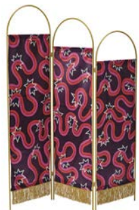
PE826649 KARISMATISK Room divider $59.99 Powder-coated steel and 100% polyester. Imported. Designer: Zandra Rhodes. W53½×H63". Purple 704.990.48