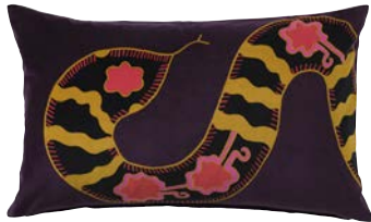
PE826638 KARISMATISK Cushion cover $9.99 100% cotton. Imported. Designer: Zandra Rhodes. L26×W16". Snake pattern purple 604.991.62