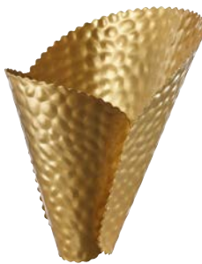
PE826644 KARISMATISK Lampshade $24.99 Powder-coated steel. Designer: Zandra Rhodes. W7×H9". Gold-color 304.990.26