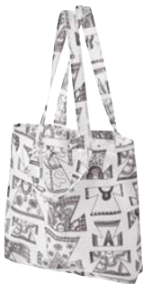
PE826630 KARISMATISK Shopping bag $1.40 100% polyester. Imported. Designer: Zandra Rhodes. W17¾×H14¼". 4 gal. White/black 605.076.90