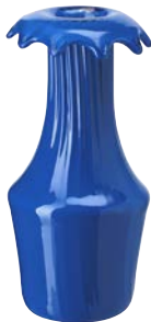
PE826662 KARISMATISK Vase $24.99 Mouth-blown glass. Designer: Zandra Rhodes. Ø4¼, H9". Blue 704.990.29