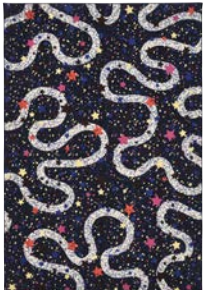
PE826650 KARISMATISK Rug, low pile $49.99 100% polypropylene pile. Synthetic latex backing. Imported. Designer: Zandra Rhodes. W4'4"×L6'5". Multicolor 204.991.35