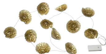
PE826645 KARISMATISK LED string lights with 12 lights, indoor, battery-operated $14.99 Plastic and 100% polyester. Imported. Designer: Zandra Rhodes. Total length 6'11". Gold-color 204.990.41