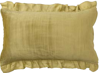
PE826636 KARISMATISK Cushion cover $9.99 100% polyester. Imported. Designer: Zandra Rhodes. L26×W16". Gold-color 704.915.56