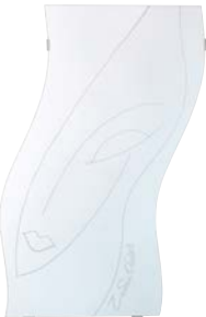
PE826646 KARISMATISK Mirror $19.99 Mirror glass. Designer: Zandra Rhodes. W22×H31½". 604.990.63