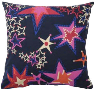
PE826641 KARISMATISK Cushion cover $5.99 100% cotton. Imported. Designer: Zandra Rhodes. 20×20". Star pattern blue 904.991.65