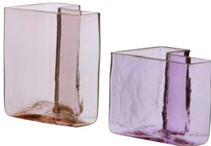
PE826624 KARISMATISK Vases $19.99/set of 2 Includes: one vase (L5⅞×W3⅞×H6¾") and one vase (5⅞×W3⅞×H4¾). Mouth-blown glass. Designer: Zandra Rhodes. Pink 404.990.35