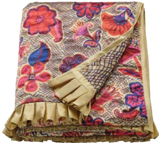
PE826660 KARISMATISK Throw $39.99 100% polyester. Imported. Designer: Zandra Rhodes. W59×L79". Floral pattern beige 005.114.21