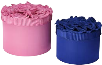
PE826628 KARISMATISK Boxes $19.99/set of 2 Includes: one box (Ø10¼, H7⅞") and one box (Ø8¼, H6¼"). Paper and 100% polyester. Imported. Designer: Zandra Rhodes. Blue/pink 504.990.87