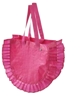
PE826632 KARISMATISK Shopping bag, medium $4.99 Polypropylene plastic. Designer: Zandra Rhodes. W15×D7¾×H14¼". 7 gal. Pink 505.038.57