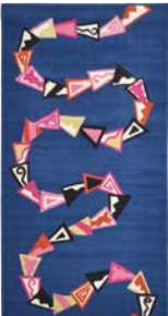
PE826653 KARISMATISK Rug, low pile $19.99 100% nylon. Imported. Designer: Zandra Rhodes. W2'7"×L4'11". Blue 004.991.41