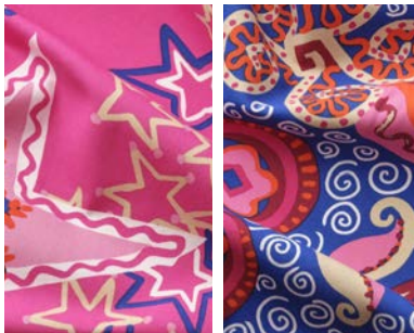
PE826647 KARISMATISK Pre-cut fabric $24.99/2pk 100% cotton. Imported. Designer: Zandra Rhodes. W59×L118". Assorted patterns pink/blue 204.992.01