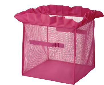
PE826627 KARISMATISK Box, foldable $6.49 100% polyester. Imported. Designer: Zandra Rhodes. W13×D13×H13". Pink 704.990.86