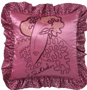
PE826639 KARISMATISK Cushion cover $7.99 100% polyester. Imported. Designer: Zandra Rhodes. 20×20". Pink 004.991.55