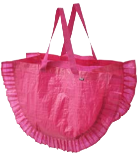
PE826631 KARISMATISK Shopping bag, large $7.99 Polypropylene plastic. Designer: Zandra Rhodes. W22½×D14¼×H15". 16 gal. Pink 704.990.67