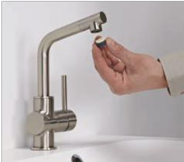
Test drive your faucet and water trap You can now connect all hoses and turn on your main water valve. Remove the filter from the faucet and let the water run for 5 minutes. Check there is no leakage around hose connections or the water trap. Then screw the filter back in place.