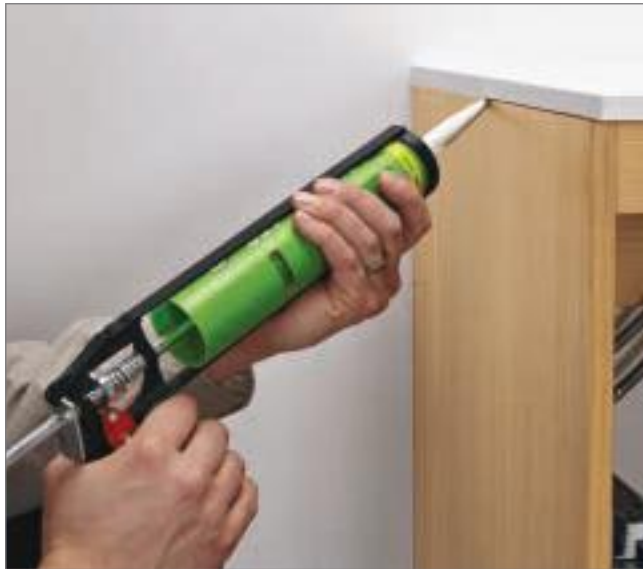
Add sanitary silicone sealant Add sanitary silicone sealant to the top edge of the cabinet sides, place the sink on top and let dry overnight. You can then add a bead of silicon between the sink and the wall. Finally, add silicone between the sink and side panels of the cabinet.