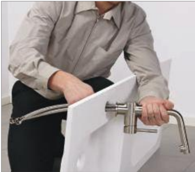
Connecting the faucet First, switch off the main water valve. Then, mount the faucet onto the sink according to the instructions. Do this before you mount the sink onto the cabinet.