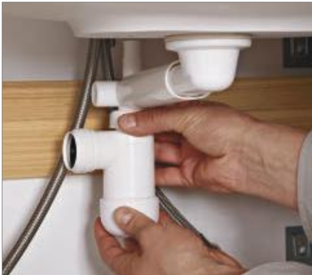
Connect the water trap to the sink You can now attach the water trap to the sink according to the instructions. Installation must be performed in compliance with current local construction and plumbing regulations. If in doubt, contact a professional.