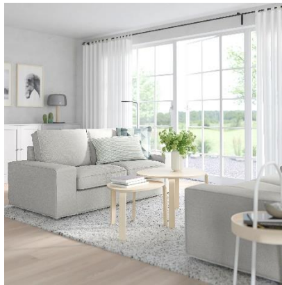
KIVIK Two-seat sofa, Orrsta light grey RM1,295 NP: RM1,395