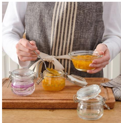
KORKEN Jar with lid RM15.90 / 3 pcs NP: RM19.90 / 3pcs