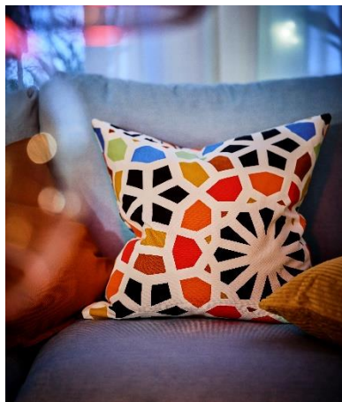
HEMBJUDEN Cushion Cover RM19.90

Tradition calls for a refreshed look at home as part of the Raya festivities, just around the corner. Whether your space exudes a traditional or minimalistic modern vibes, there's something for everyone with limited-edition HEMBJUDEN collection, available across all stores and online ( *Whilst stocks last ). Impress your guests and make it a Raya to remember!