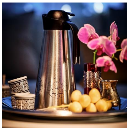
HEMBJUDEN Vacuum Flask RM99.00 HEMBJUDEN Cups/6 pieces RM49.90