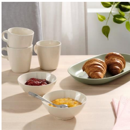
FÄRGKLAR Bowl RM15.90 / 4 pcs NP: RM19.90/ 4 pcs