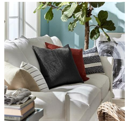
VIGDIS Cushion cover RM19.90 NP: RM29.90