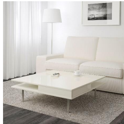
TOFTERYD Coffee table RM799 NP: RM999