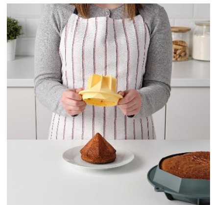
TÅRTBAK Baking mould RM19.90 NP: RM29.90