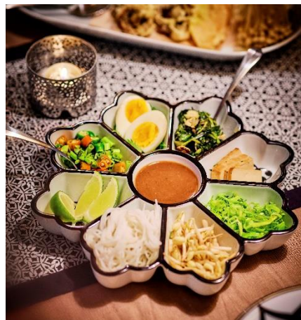
HEMBJUDEN Serving Plate RM99