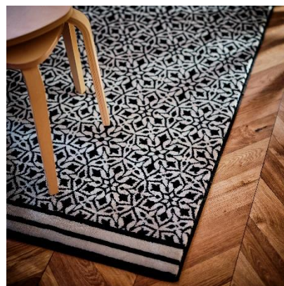
HEMBJUDEN Rug RM599.00