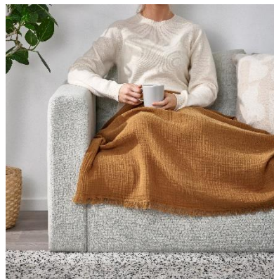
VALLKRASSING Throw RM59 NP: RM89