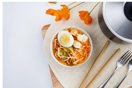
Go on and treat yourself with a delightful bowl of laksa on Thursdays. RM 3.50