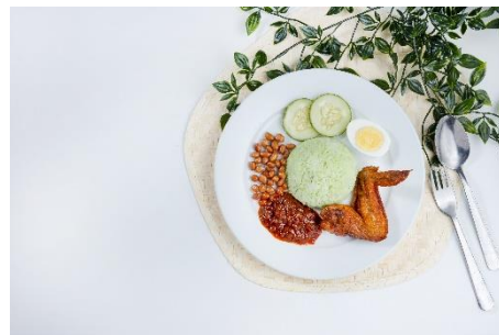
Start your work days on the fulfilling note with Nasi Lemak Pandan with Signature Fried Chicken Wings from Monday to Thursdays! RM 5.90