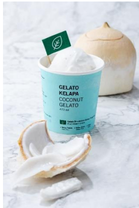
Coconut Gelato RM34.50

We believe that offering healthy, affordable yet delicious food options plays a key role to improving people's lives at IKEA. IKEA has four new delectable plant-based ice cream flavours for everyone to enjoy. This is only the start of some plant-based goodness, so stay tuned for more!