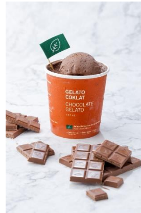
Chocolate Gelato RM34.50