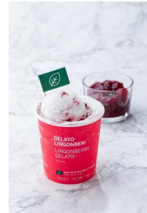
Lingonberry Gelato RM34.50

Get your cravings fixed with the wide range food, from snacks, mains to desserts this September and check out our latest offerings IKEA.my/restaurant