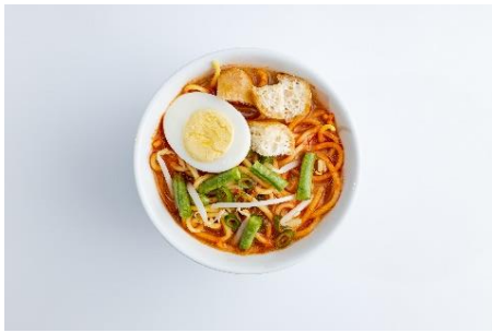
Beat your Monday blues with a hearty bowl of mee curry. RM 3.50