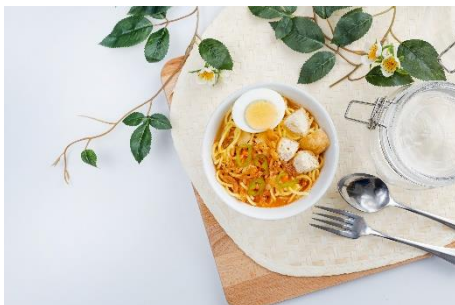
Spice up the mid week on Wednesdays with mee rebus RM 3.50