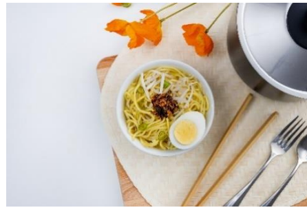
Warm the soul with mee soto on Tuesdays RM 3.50