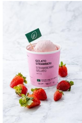
Strawberry Gelato RM34.50