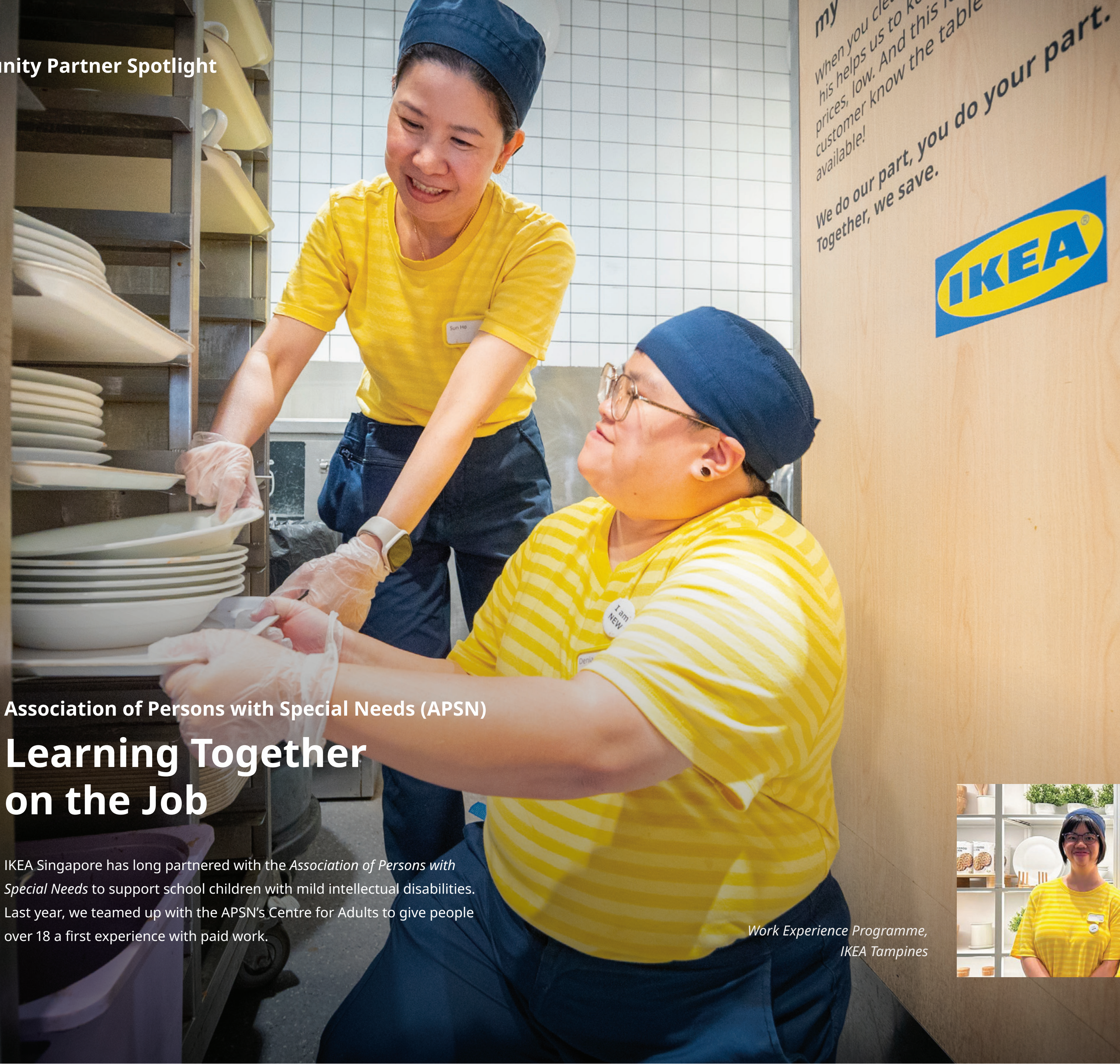
Work Experience Programme, IKEA Tampines

IKEA Singapore has long partnered with the Association of Persons with Special Needs to support school children with mild intellectual disabilities. Last year, we teamed up with the APSN's Centre for Adults to give people over 18 a first experience with paid work.