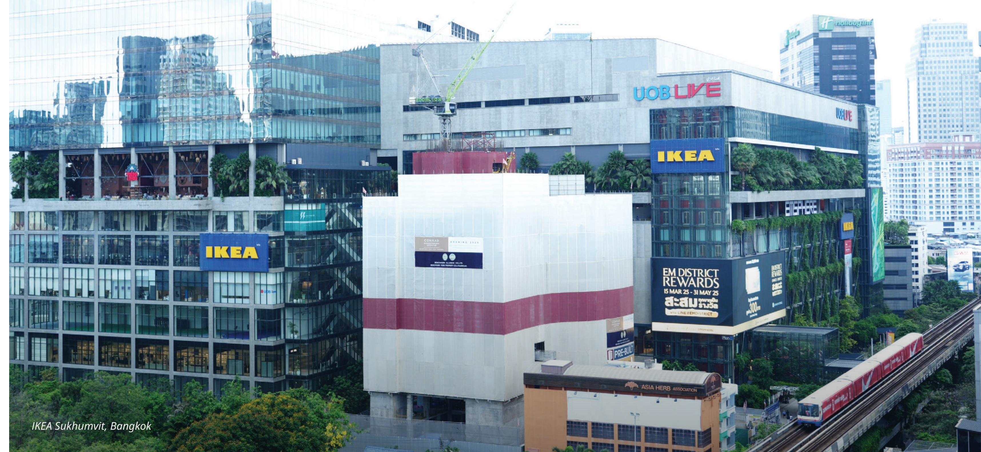
IKEA Sukhumvit, Bangkok

The initiative was widely promoted with billboards and, from February to May 2025, customers redeemed 1,287 coupons. More than 100 co-workers participated, too.