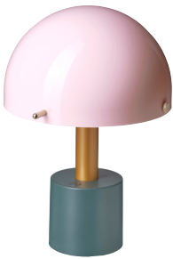
NÖDMAST LED portable lamp