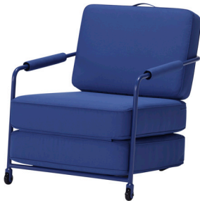
BRÄNNBOLL Gaming lounge chair