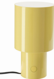
SPETSBOJ Table lamp