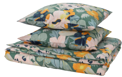
FÄLTGRÄSMOTT Duvet cover and pillowcases