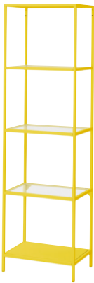
VITTSJÖ Shelving unit Available Spring 2025