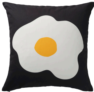
ÖGONLOCKSMAL Cushion cover Available Spring 2025