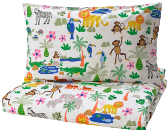
NATTHÄGER Duvet cover and pillowcase Available Spring 2025