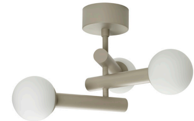
KRANBALK Ceiling lamp Available Spring 2025