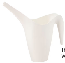
IKEA PS 2002 Watering can

2. Experiment, assemble and create creatures and plants based on the template, or create something completely different. It's a lot of fun!