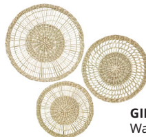
GILLSTAD Wall decoration