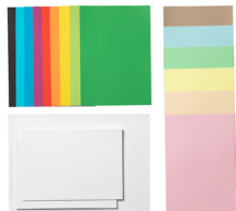
MÅLA Paper, mixed colours and sizes