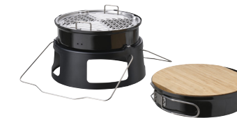
PE849379 New KÅSEBERGA portable charcoal barbecue $69.99 Steel and bamboo. Designer: R Machado/M Mehmetalioğlu. Ø35, H26cm. Black