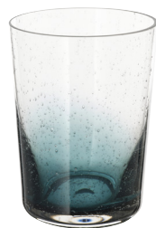
PE849367 New KÅSEBERGA glass $4.99 Glass. Designer: K Meador/W Braasch. H27cm. 35cl. Blue