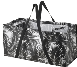
PE849339 New KÅSEBERGA bag $7.99 100% polypropylene. Designer: K Meador/W Braasch. L80×D35, H30cm. Black/white