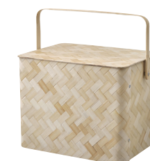
PE849363 New KÅSEBERGA cool basket $49.99 Box: Bamboo. Inner fabric/outer fabric: 100% cotton. Designer: R Machado/M Axelsson. L35×W25, H26cm.