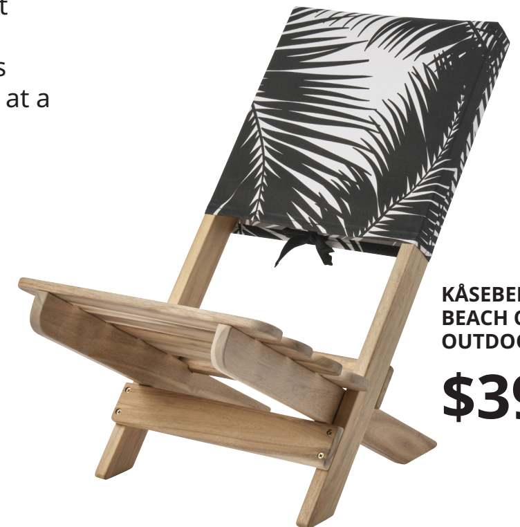
KÅSEBERGA BEACH CHAIR, OUTDOOR