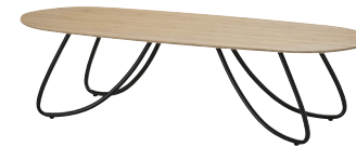
PE849361 New KÅSEBERGA coffee table $99 Bamboo and powder coated steel. Designer: R Machado/M Axelsson/W Braasch. L120×W42, H31cm.