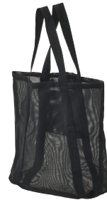
PE849337 New KÅSEBERGA bag $9.99 100% polyester. Designer: K Meador/W Braasch. W37×D12, H45cm. Black