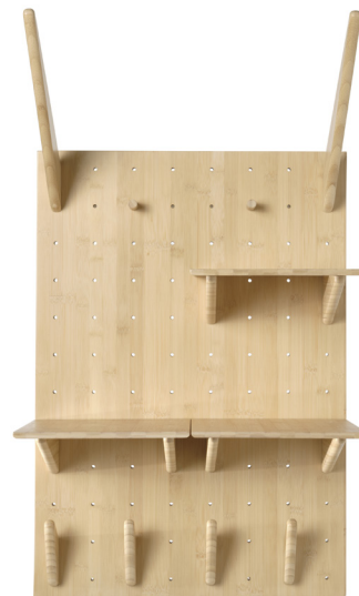
KÅSEBERGA pegboard $99

Today, there are 370 million people across the world interested in surfing and more than 40 million active surfers. And since the sport, quite naturally, takes place in open waters, surfers are generally passionate about tackling environmental challenges such as reducing plastic pollution in the oceans.