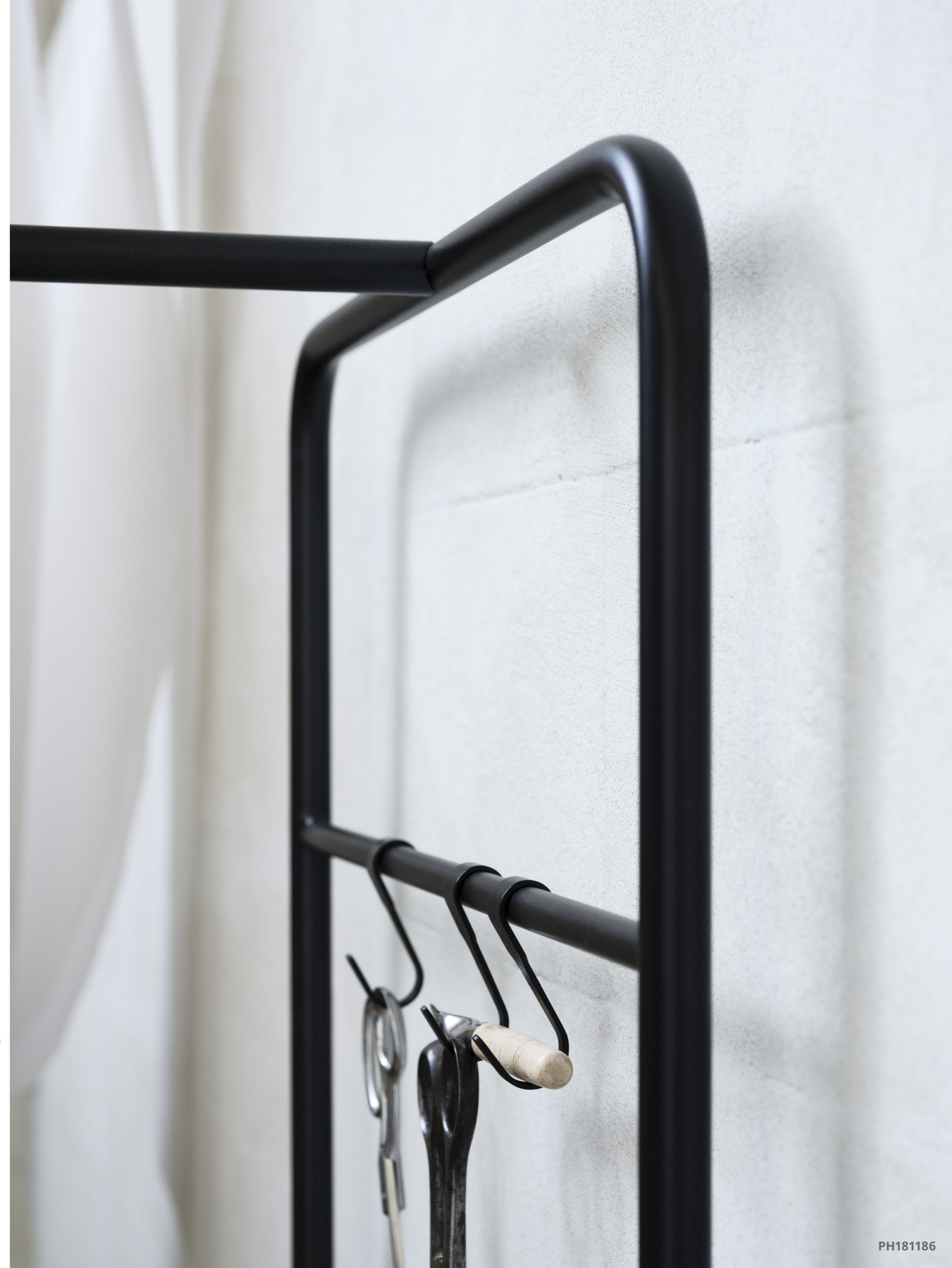
HÅVERUD table with storage ladder $169.

The antique-look table is a perfect work surface for a variety of activities and hobbies. The ladder is designed to store clothes, bags, utensils, small containers and can be combined with several add-on accessories.