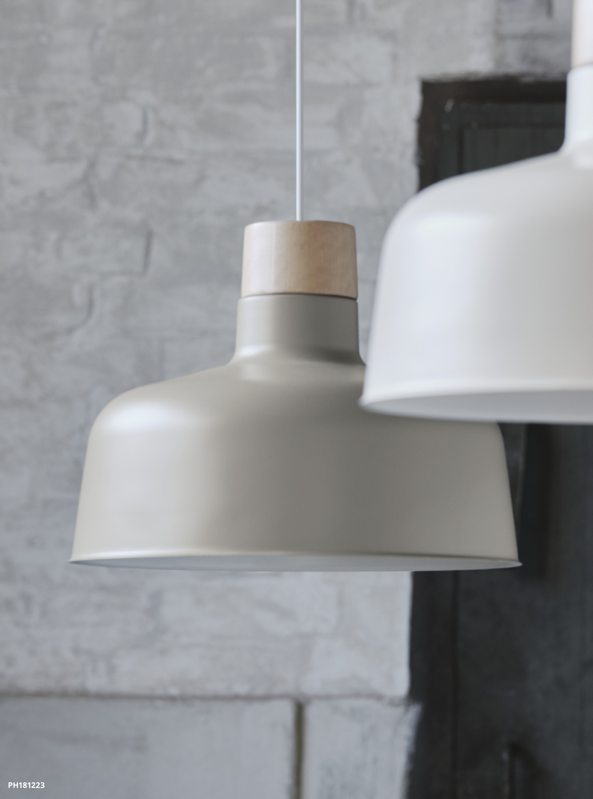
BUNKEFLO pendant lamp $34.99/each Beige/White