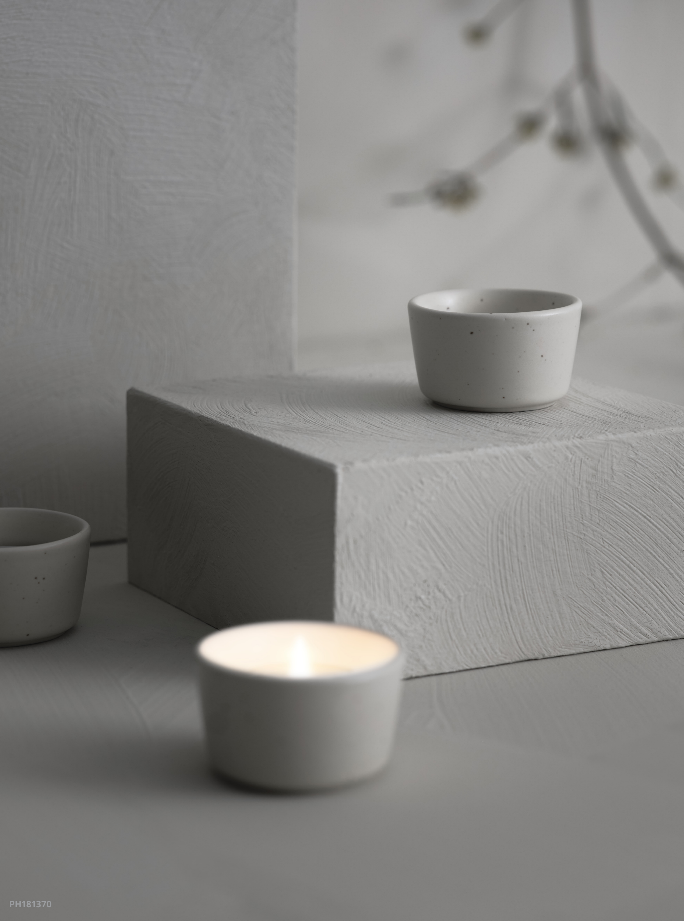
ÄROFULL tealight holder $0.99/each