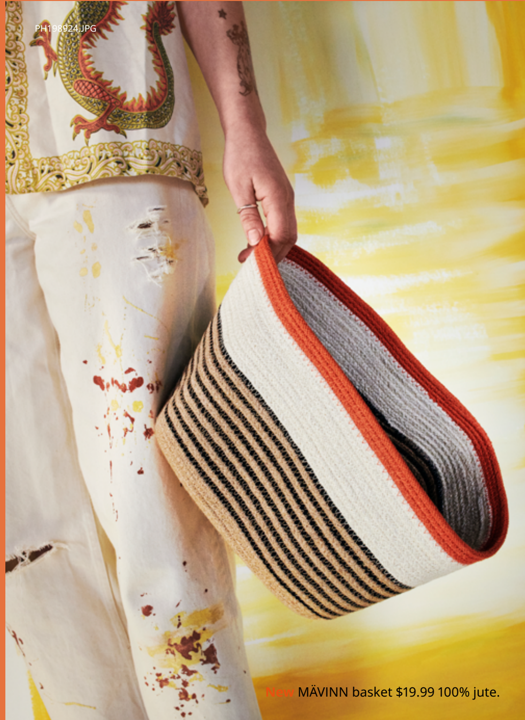
New MÄVINN basket $19.99 100% jute.

It's been 12 years since IKEA first started collaborating with social enterprises around the world. Together, we develop unique, handmade products designed to create jobs for women and marginalised groups in regions where it's most needed. Today, the partnerships generate work for 11 000 people and the joint venture continues.