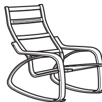
Rocking chair frame available in birch veneer, black-brown and medium brown.