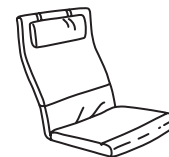
Cushion design with Vislanda fabric covers.