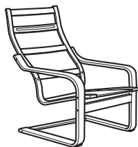
Armchair frame available in birch veneer, black-brown, and medium brown.

The frames come in different types of wood and with different finishes.