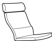
Cushion design with Hillared and Lysed fabric covers or Glose leather cover.

The cushions come with covers in different designs, materials and colours. Combine the way you want.