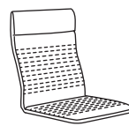
Cushion design with Knisa covers.