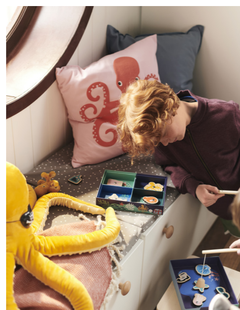
Consisting of two fishing rods and eleven different shapes, the BLÅVINGAD fishing game is a great example of how kids can learn about the world through play. By instructing children to pluck out bits 'n' bobs to recycle from the sea, they discover the importance of keeping the sea clean.

Young minds are constantly whirling with questions like these. One way kids can get to the bottom of all their queries, is by discovering the world by playing. Through the magic of make believe, role play and educational games, children embark on a learning odyssey all of their own.