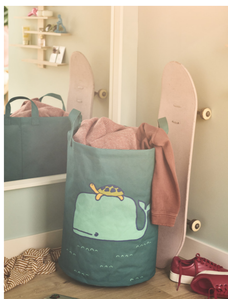
Between school, extra-curricular activities, and their latest mission, young teens always have a busy schedule. The BLÅVINGAD storage bag, is a handy solution to keep on track of things. Printed with the coordinates of the Great Barrier Reef, it's also a little reminder of the magnificent natural phenomena that are worth keeping safe.

We all remember what it's like to be a kid: filled with ideas, curious and inspired to change the world! Play is an essential part of that journey - it's how we express who we are and what we care about. With shimmering coral cushions, characterful two-sided bed linen and accessories made from recycled materials, the BLÅVINGAD collection creates an inspiring personal space for kids who dream that the future will be bright.