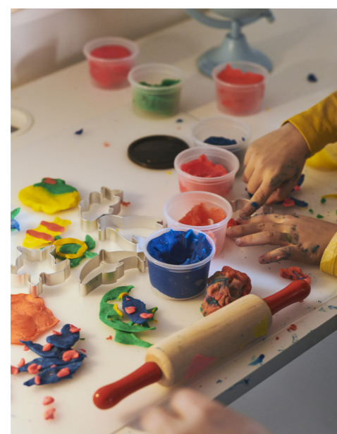
Kids can cut out cute characters and shapes inspired by the ocean with these modelling dough cutters. This hands-on activity is a great way for little ones to fine tune motor skills and hand-eye coordination.

The BLÅVINGAD collection encourages kids to get creative. Whether doodling and colouring in favourite marine creatures, or cutting out sea shapes from moulds, creative activities allow the imagination to flow and young artistic minds to flourish. Time to get stuck in!