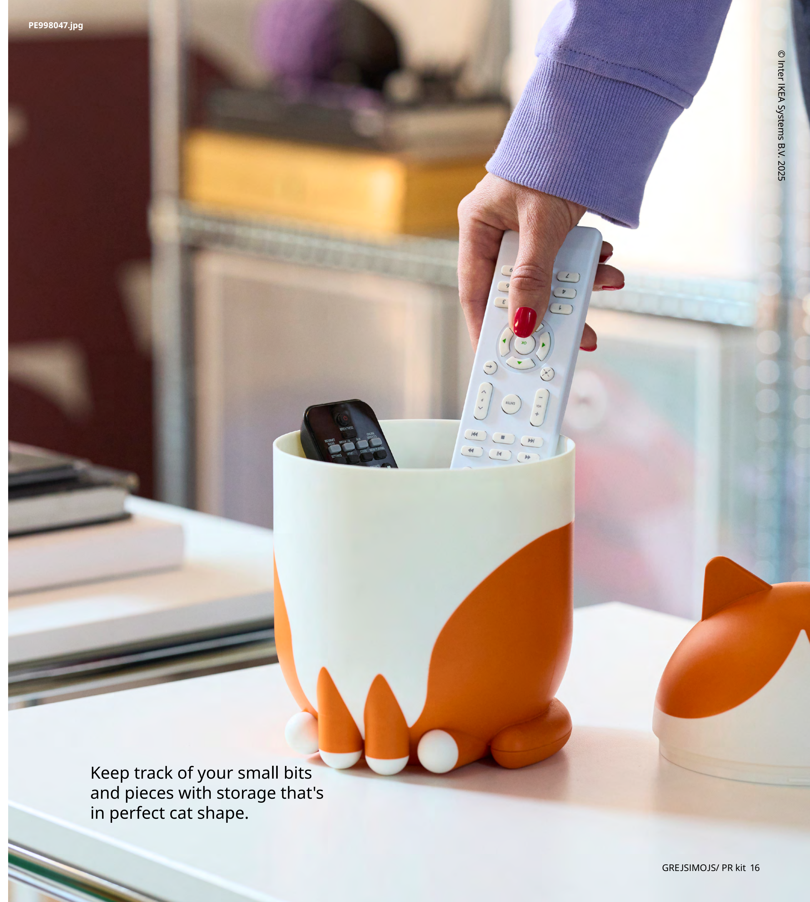
Keep track of your small bits and pieces with storage that's in perfect cat shape.