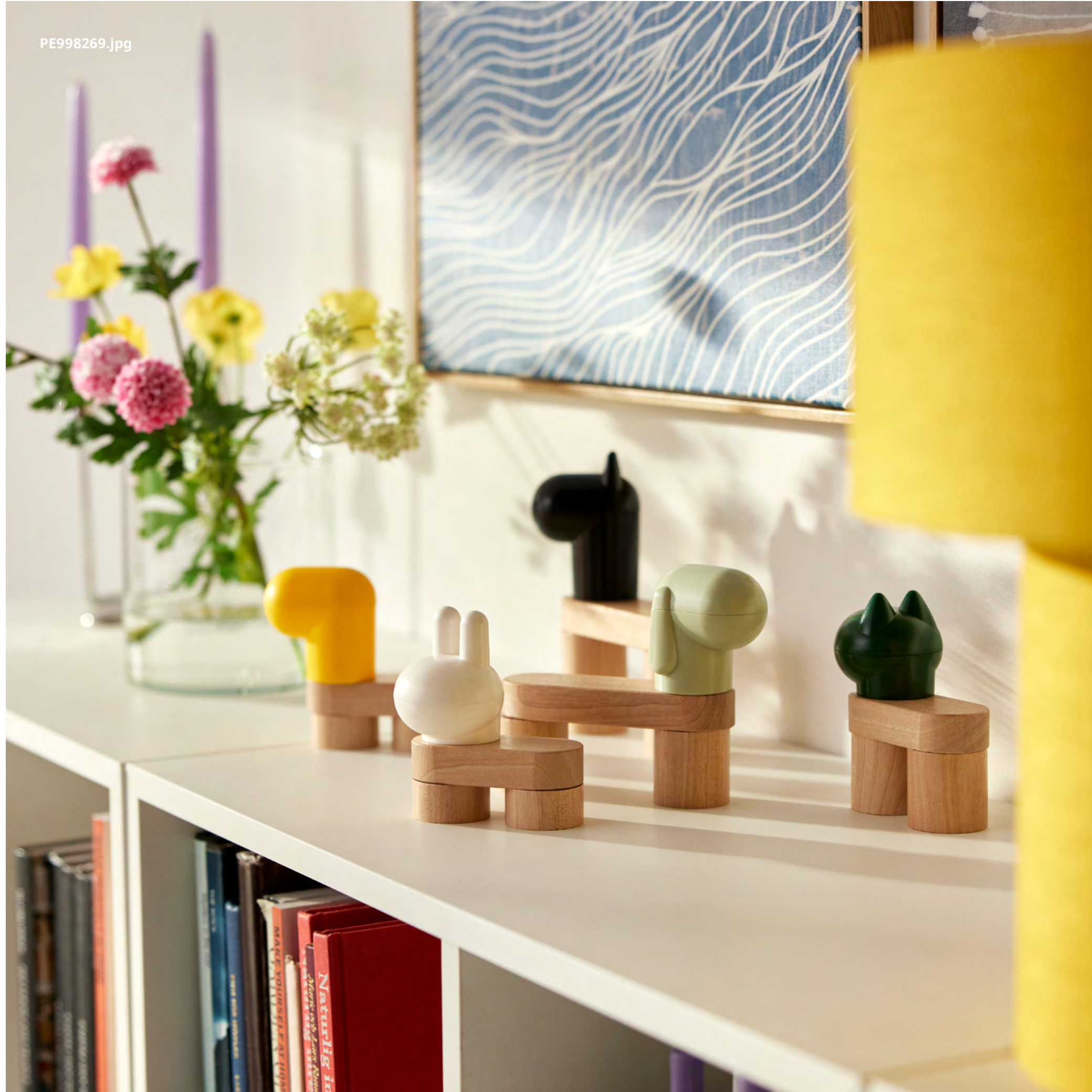
GREJSIMOJS toy building blocks. 20 pieces that can be assembled and reassembled over and over and over again. And when no one's playing with them, they double as fab decoration.