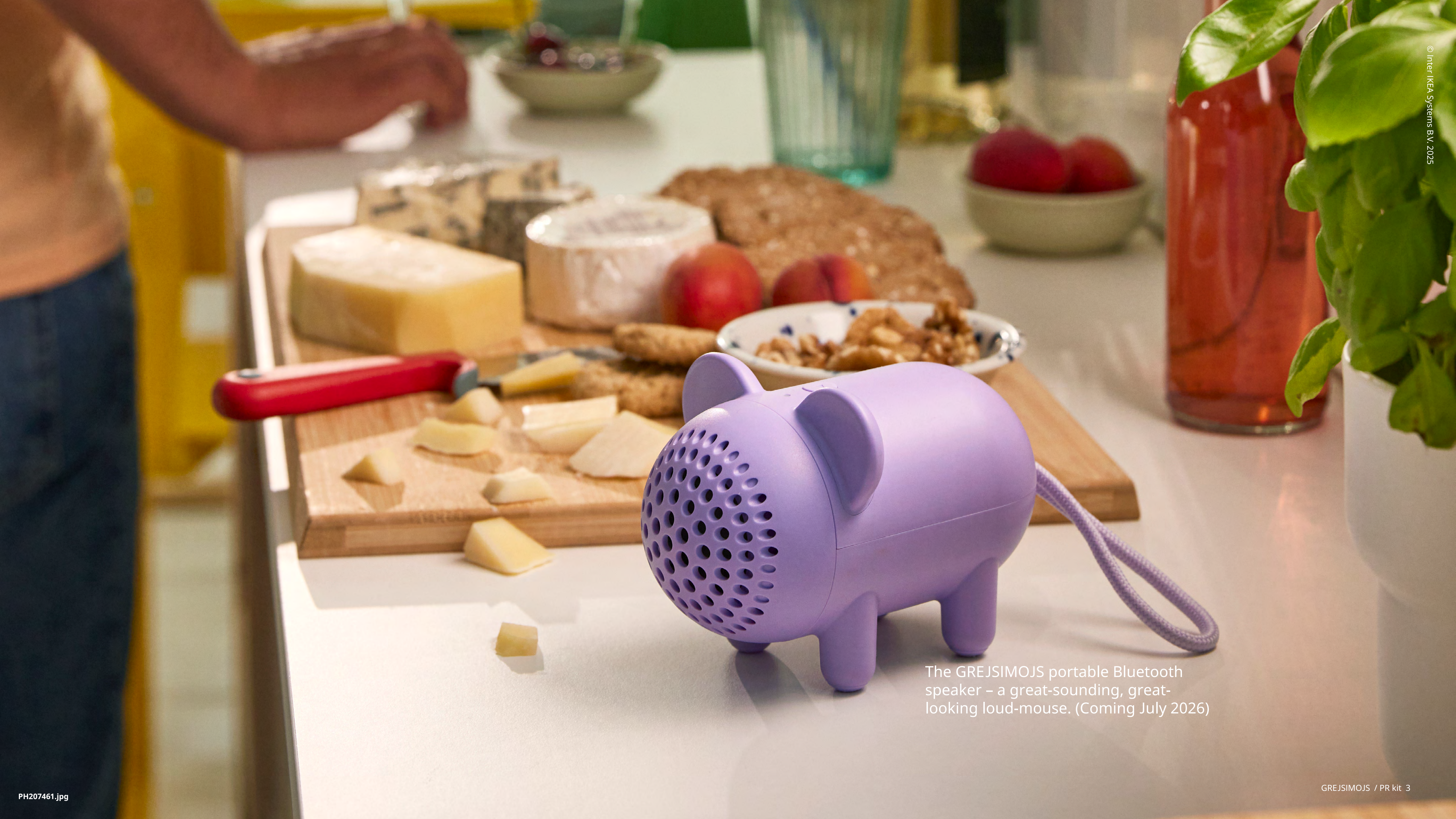
The GREJSIMOJS portable Bluetooth speaker – a great-sounding, great-looking loud-mouse. (Coming July 2026)