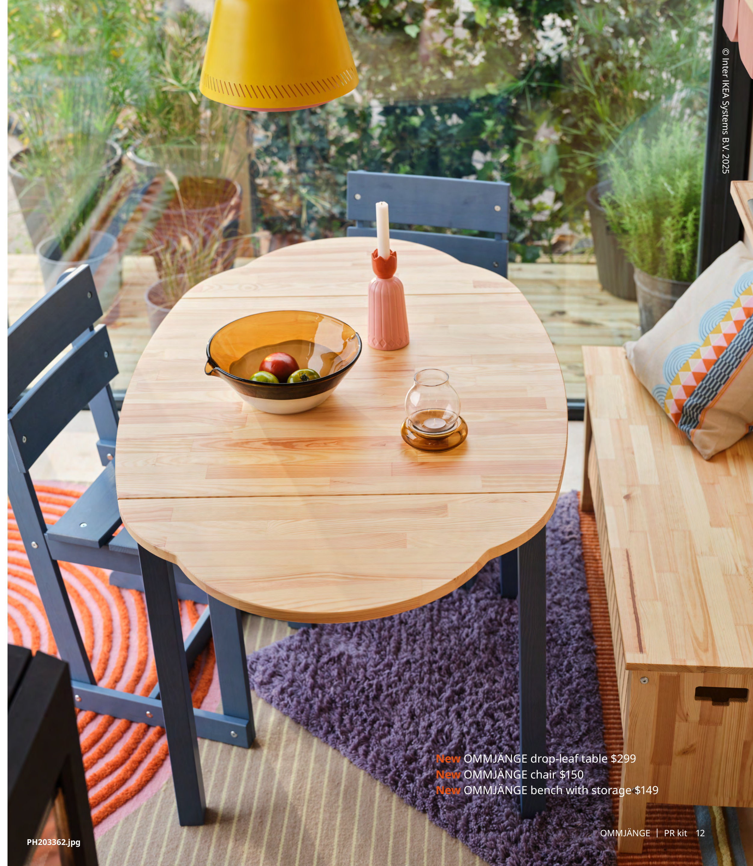
New OMMJÄNGE drop-leaf table $299 New OMMJÄNGE chair $150 New OMMJÄNGE bench with storage $149