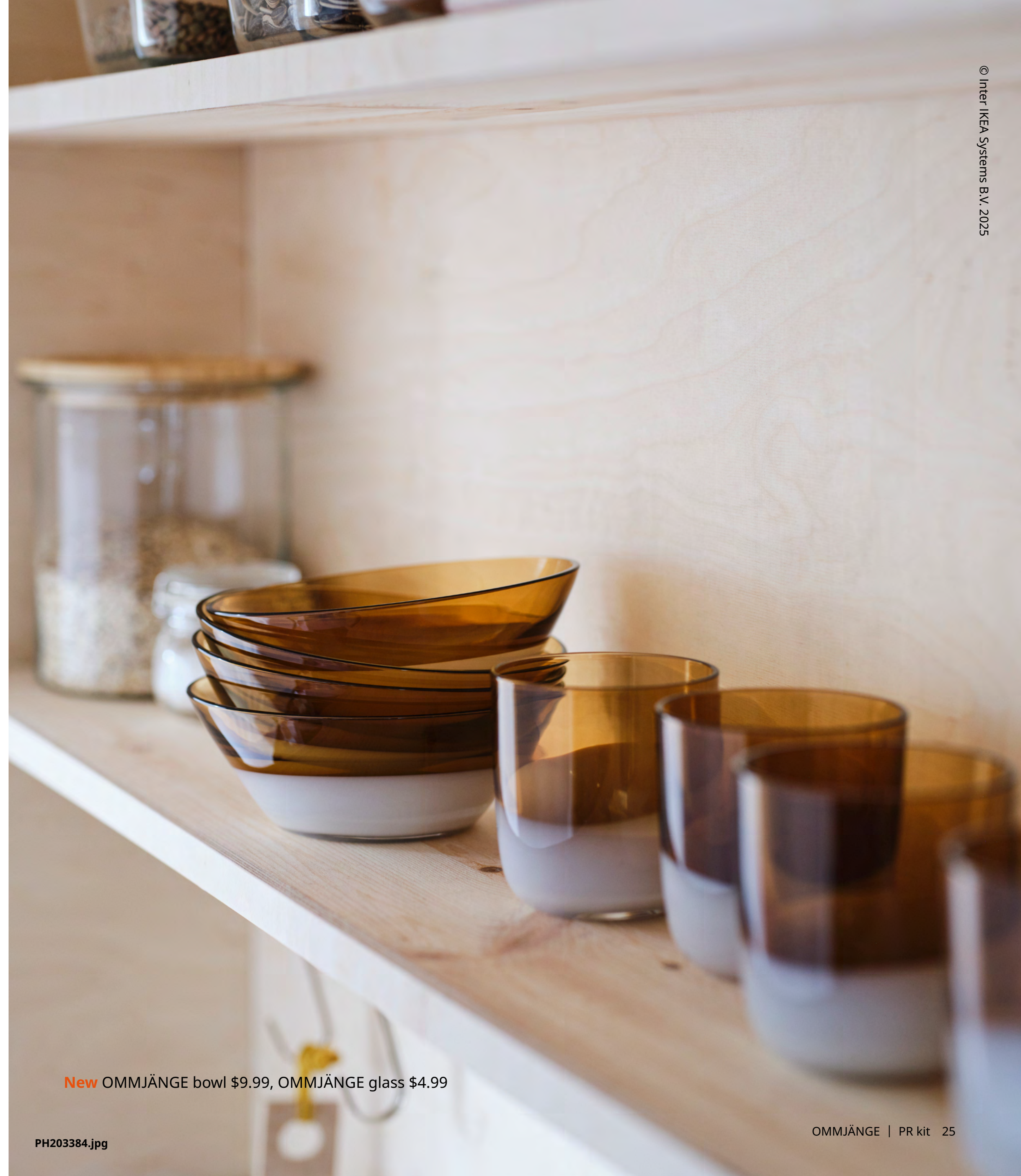
New OMMJÄNGE bowl $9.99, OMMJÄNGE glass $4.99