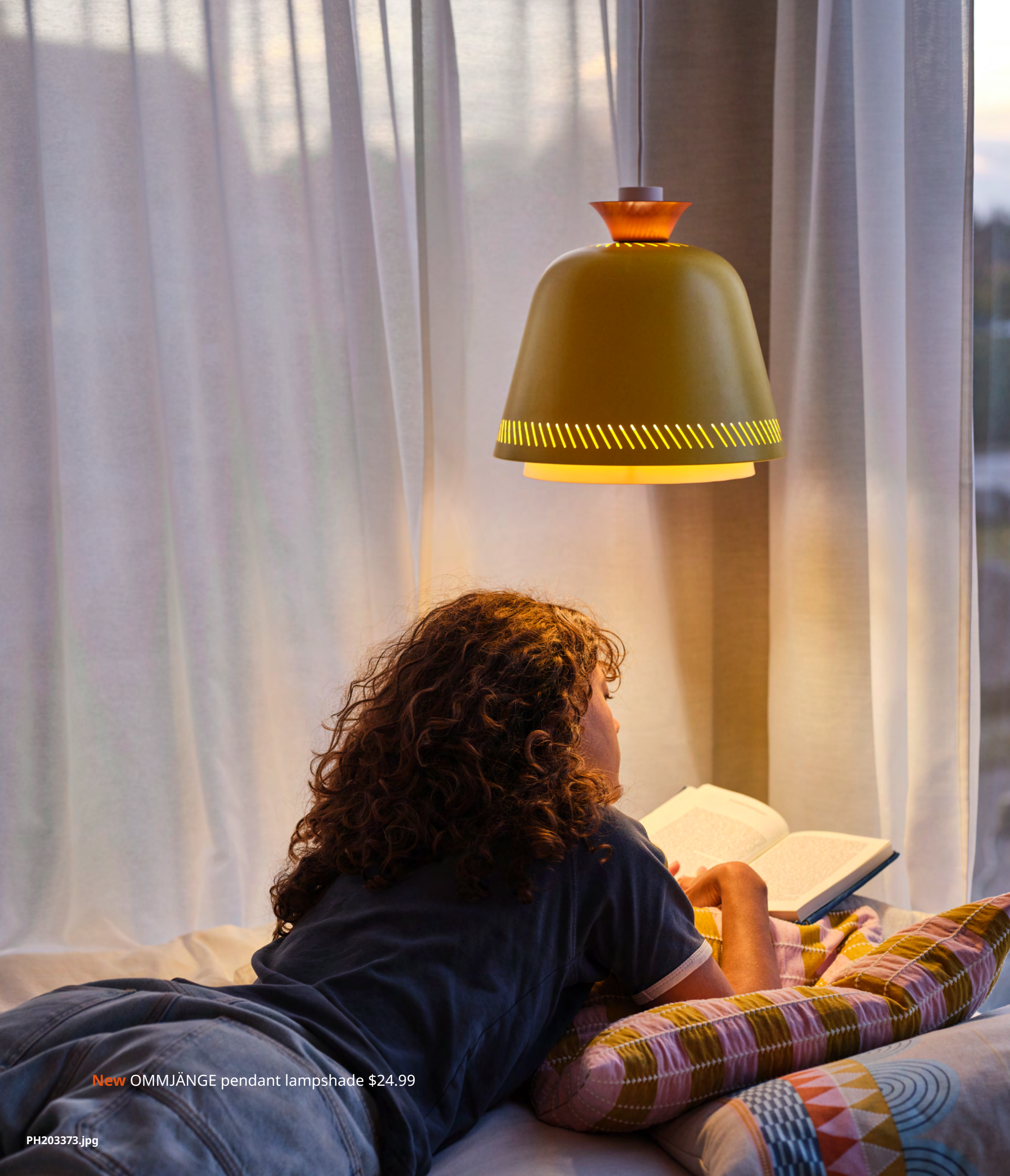
New OMMJÄNGE pendant lampshade $24.99