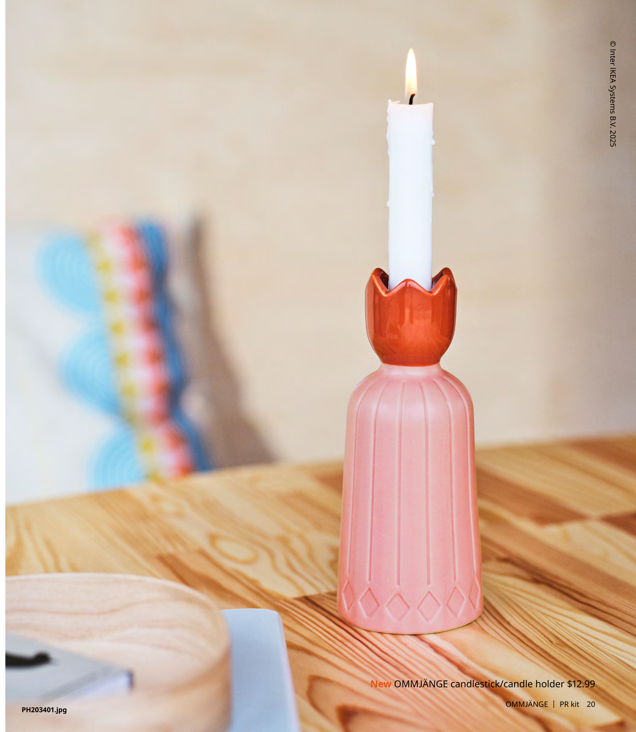
New OMMJÄNGE candlestick/candle holder $12.99