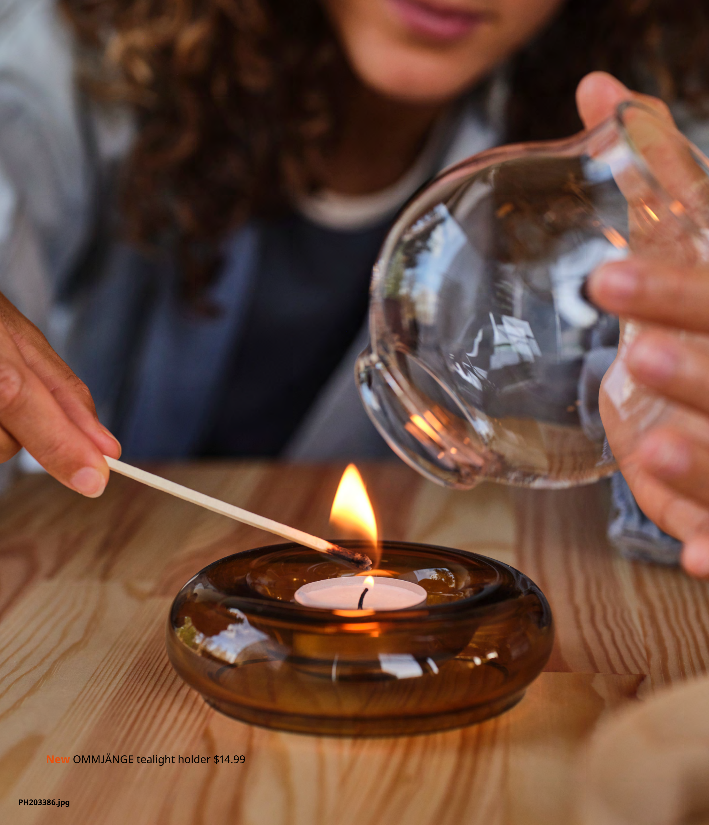
New OMMJÄNGE tealight holder $14.99