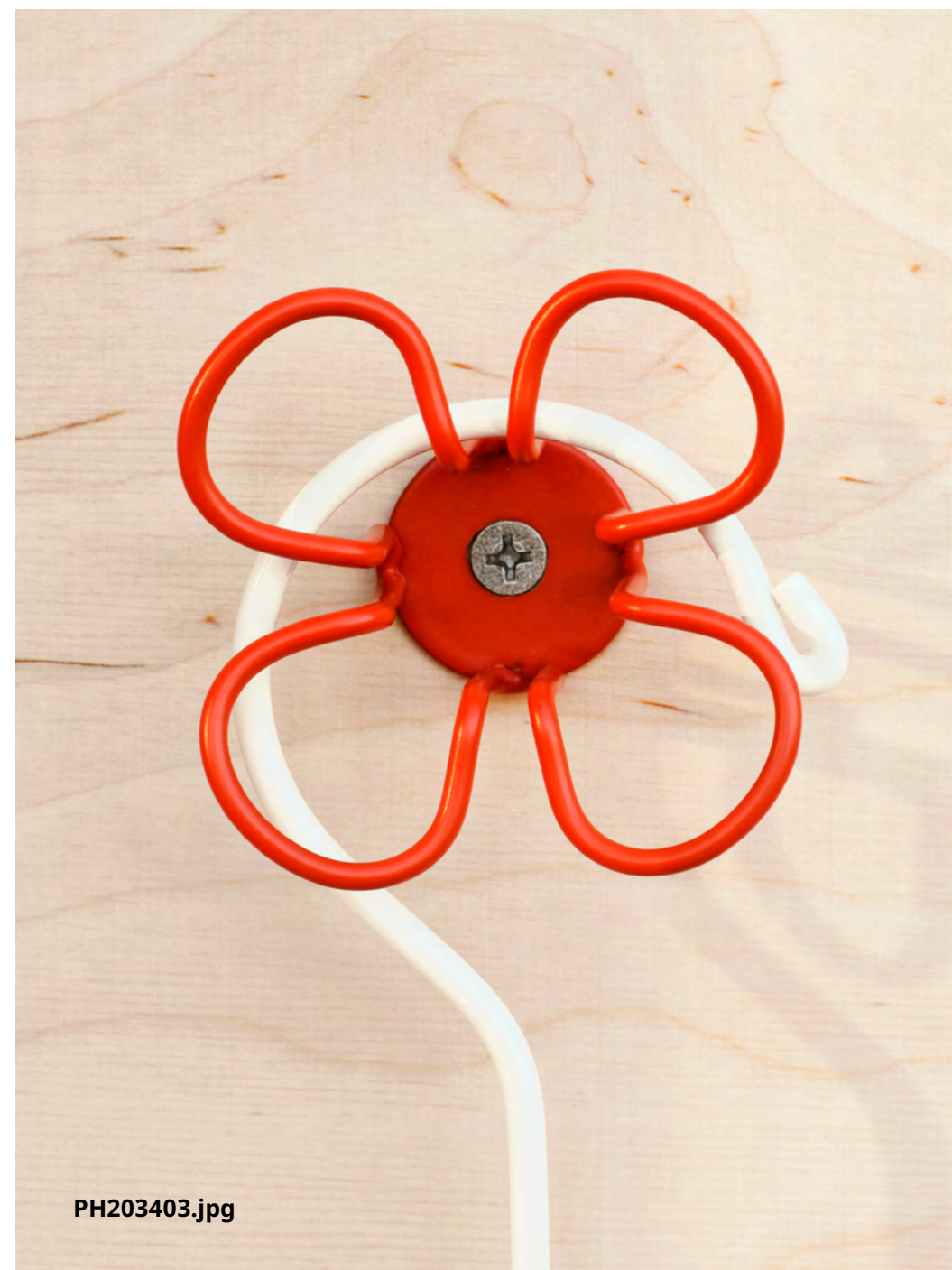
New OMMJÄNGE wall hook $5.99/3-pack

The OMMJÄNGE wall hooks were inspired by the traditional method of twisting metal wire. Coated in cheerful colours with a clover shape, they come in a set of three. Let these bold wallflowers transform any unused space into practical storage.