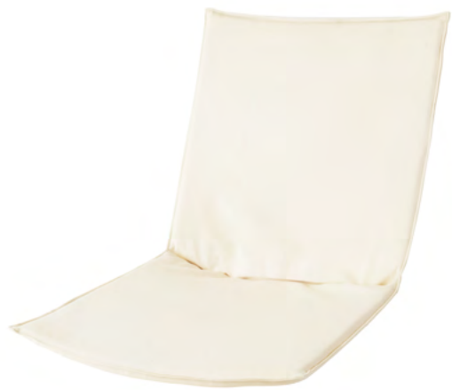
PE957889.jpg New SKÅLBODA armchair cushion $34.99 100% polyester. L96×W48cm. Ransta beige 705.567.79