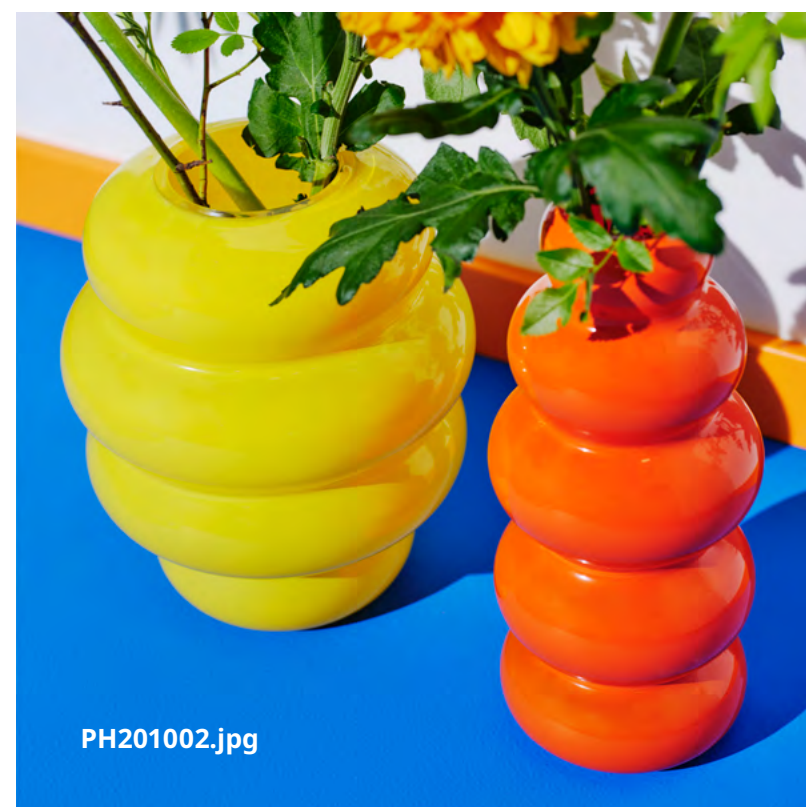
Above: SNURRA vases 1996