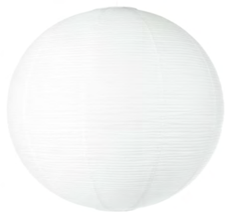
PE957826.jpg New GULLSUDARE pendant lampshade $9.99 Powder coated steel and rice paper. Ø70cm. White/handmade 805.836.16